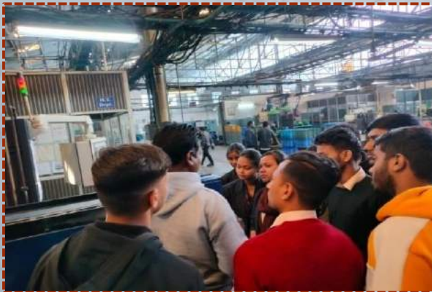
Students from Ranchi centre visited at M/s. SNL Bearing Limited, Ranchi, Jharkhand on 18 th December, 2023.