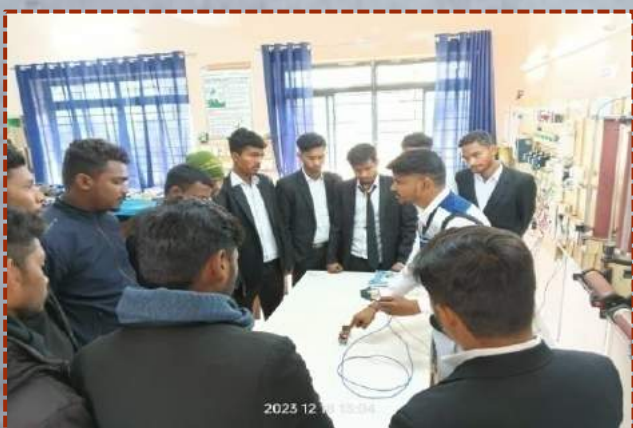
One day Industries workshop on “Basic Electrical & Industrial Wiring” for the Diploma pursuing students of Vidya Memorial Institute, Tupudana at Ranchi centre on 18 th December, 2023.