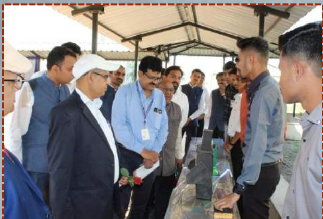
Chandrapur centre students displayed the projects developed by “reusing Plastics Waste” on 11 th December, 2023.