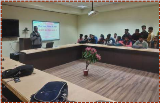
Observance of World AIDS Day at Murthal centre on 1 st December, 2023.