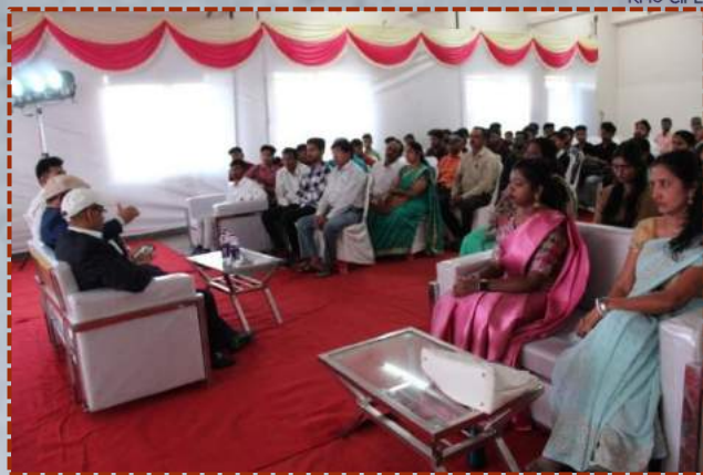
Parents Meet was organized at Chandrapur centre on 11 th December, 2023 in which around 75 parents participated.