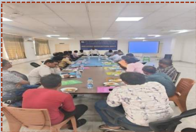
Industry Interaction Meet was organized at Vijayawada centre on 22 nd December, 2023.