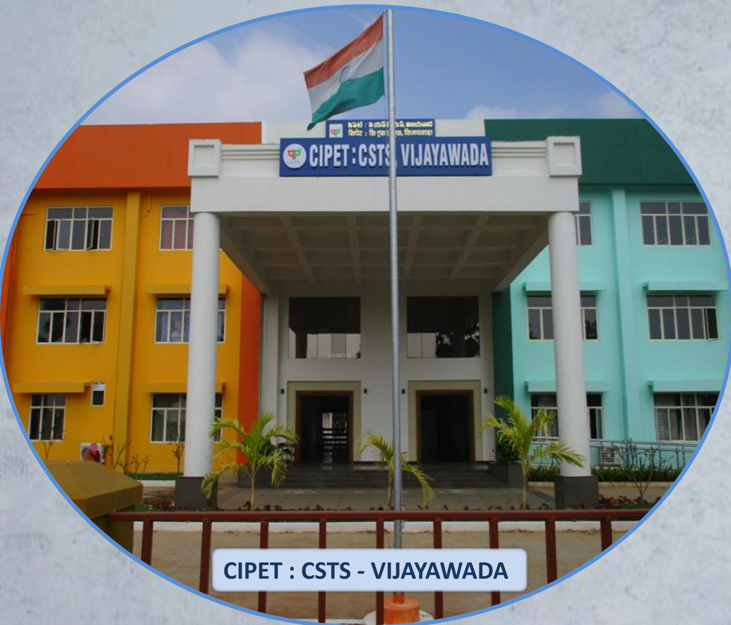
CIPET : CSTS - VIJAYAWADA

Department of Chemicals & Petrochemicals Ministry of Chemicals & Fertilizers Govt. of India