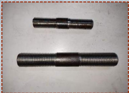
Product Name: : Machining of various size studs Centre: Raipur