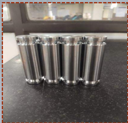
Product Name: Machining of various Pins in CNC Lathe(EN19) Centre: Raipur