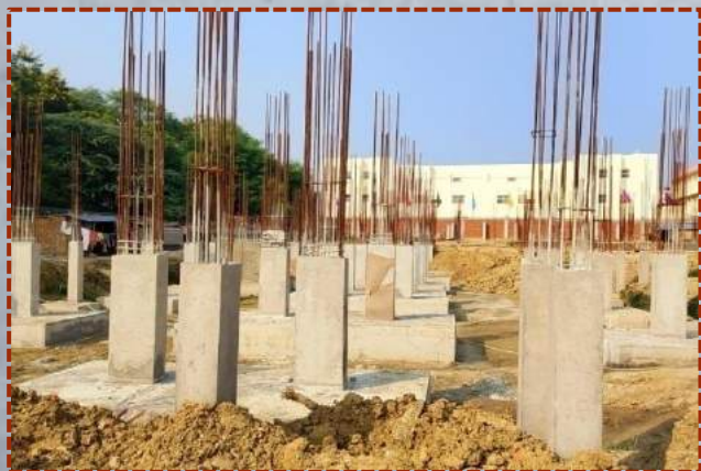
Construction of Varanasi centre Hostel building.