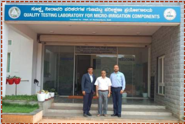
Officials from SARP – APDDRL, Bengaluru, visited University of Agricultural Sciences, Bengaluru, to discuss collaborative projects on 15 th December, 2023.