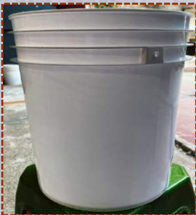
Product Name: 20ltr Container & LID Centre: Bhubaneswar CSTS