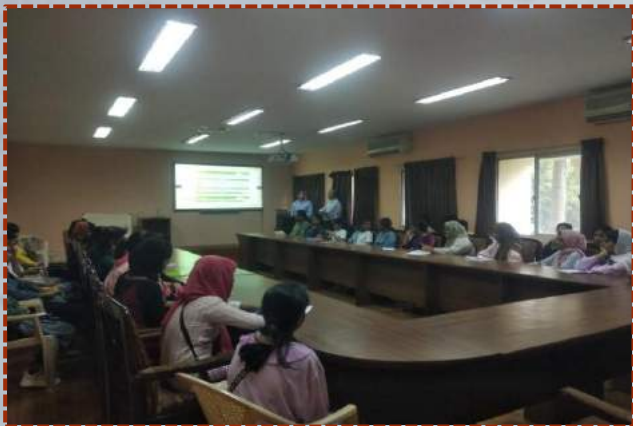
Students from MES Keveeyam College-Valanchery visited Mysuru centre on 18 th December, 2023.