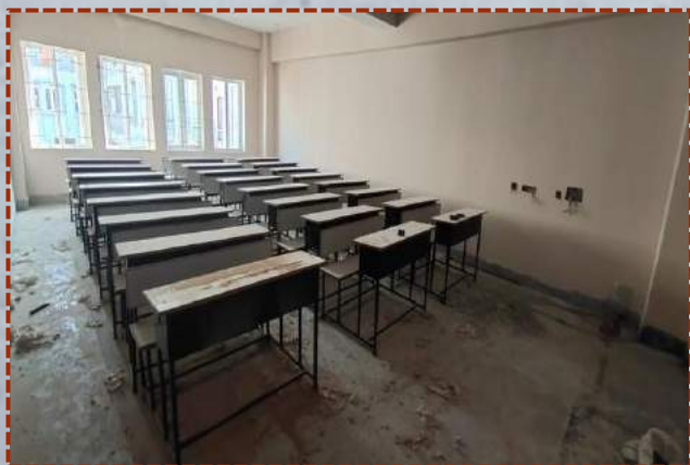
Cum Workshop Building at Ranchi centre.