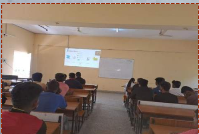
Mysuru centre students attended Free Online seminar conducted by UNICEF on 23 rd December, 2023.