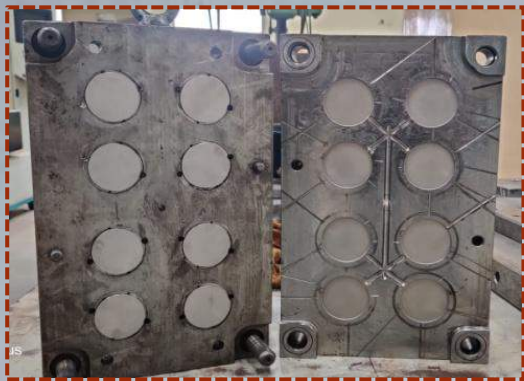
Product Name: Fine EDM Machining of LED Diffuser Mould Core & cavity Centre: Murthal