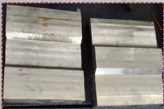
Product Name: Machining of Die and Punch (EN19) Centre: Raipur