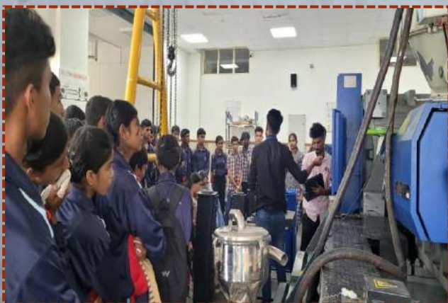
Students from T.R.K Higher secondary school visited Palakkad centre on 8 th December, 2023.