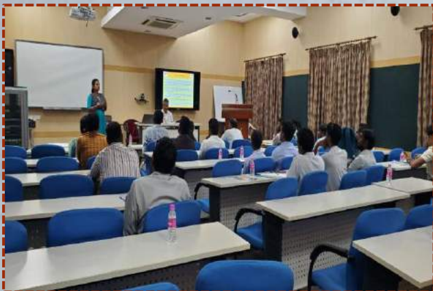
Industry Interaction Meet was organized at Chennai centre on 21 st December, 2023.