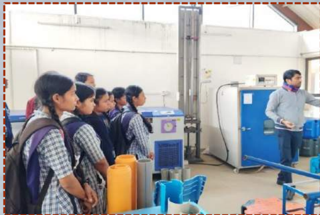
Students of Anandanagar H.S. School, visited Agartala centre on 15 th December, 2023.