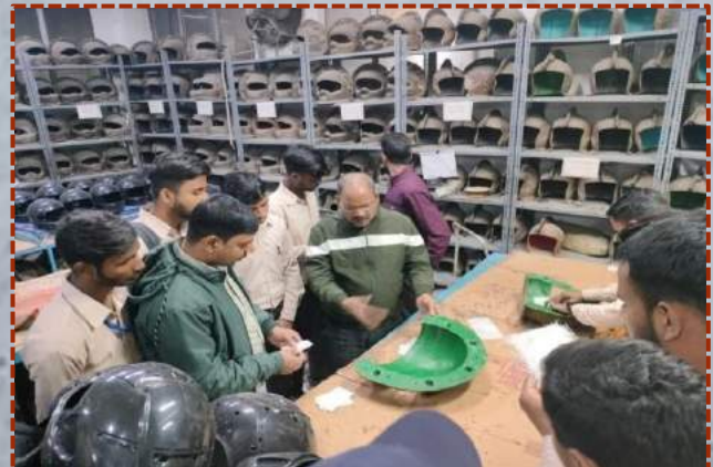
Students of Baddi centre visited M/s. Steelbird on 20 th December, 2023.