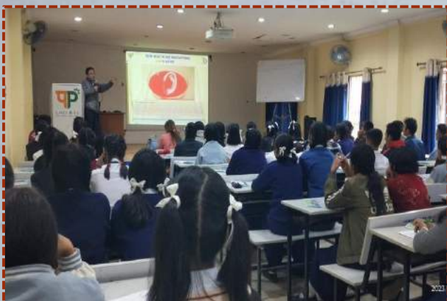
School students visited at Imphal centre under the guidance of Additional State Project Director, SAMAGRA SHIKSHA, Manipur on 7 th December, 2023.