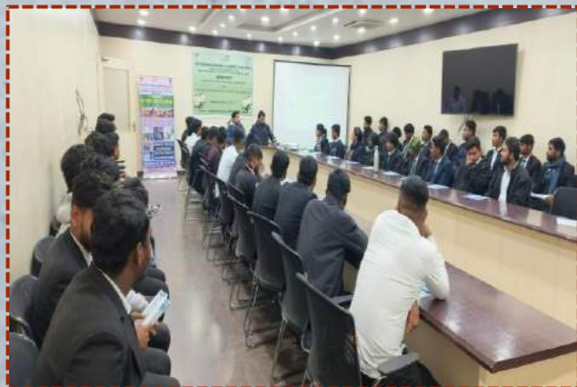
One day Industries workshop on “Advance Manufacturing Technique” for the Diploma pursuing students of Vidya Memorial Institute, Tupudana at Ranchi centre on 18 th December, 2023.