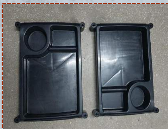
Product Name: Saloon Tray Centre: Amritsar