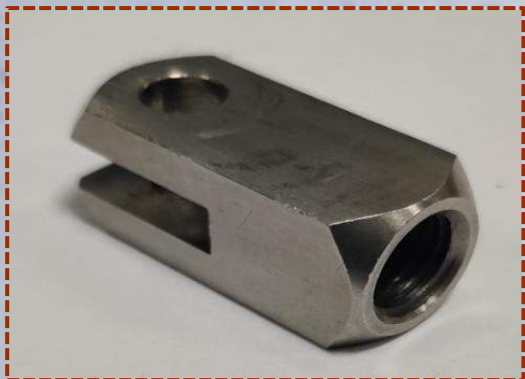
Product Name: Stainless Steel components for automation machine Centre: Murthal