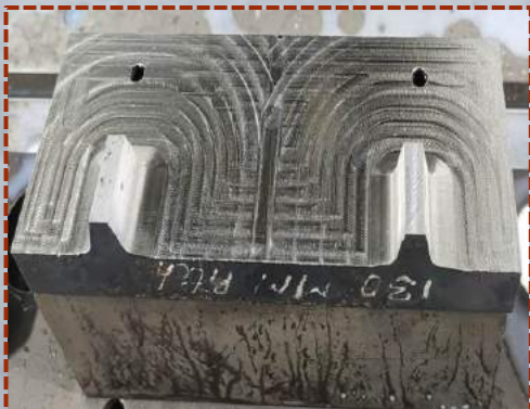
Product Name: Machining of Punch in CNC Milling Centre: Raipur