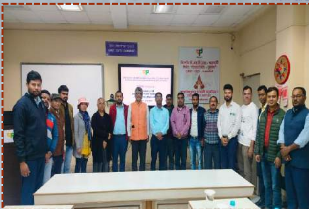
Industry Interaction Meet was organized at Guwahati centre on 19 th December, 2023.