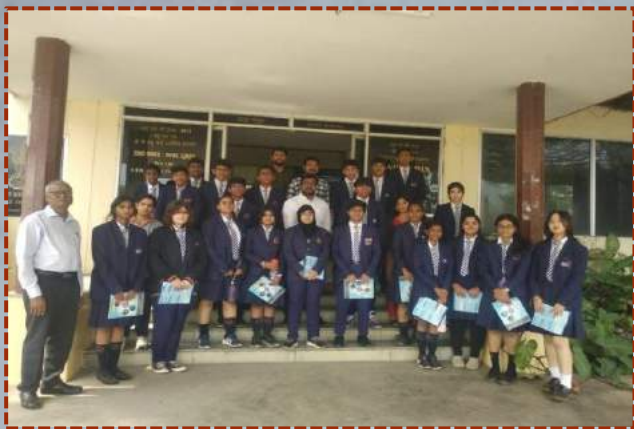
Students from The Learning Curve International School- Mysore visited Mysuru centre on 19 th December, 2023.