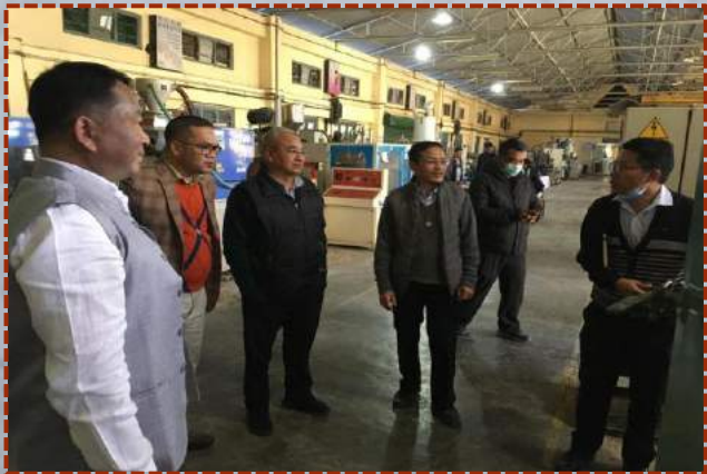
Deputy Director of Social Welfare Department, Govt. of Manipur visited Imphal centre on 4 th December, 2023.