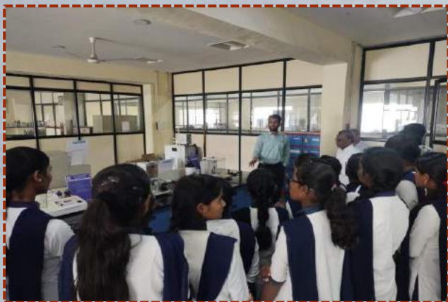
One day Awareness Programme on "Plastics and Petrochemicals in Retail Management", for Zilla Parishad (ZP) School, Chincholi, Taluka Kannad, Aurangabad was organized at Aurangabad centre on 27 th December, 2023.