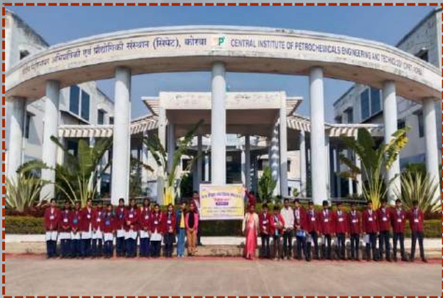
Students of Jawahar Navodaya Vidyalaya, Korba (C.G.) visited Korba centre on 14 th December, 2023.