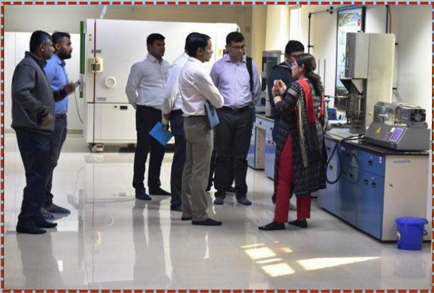
Delegates from Armament Research & Development Establishment (ARDE), Pune, Ministry of Defence, Govt. of India visited CIPET:SARP-LARPM, Bhubaneswar on 15 th December, 2023.