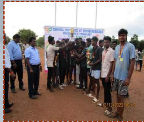
At Madurai centre from 4 th to 8 th December, 2023.