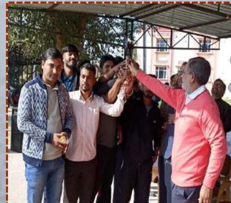
At Jaipur CSTS centre from 11 th to 13 th December, 2023.