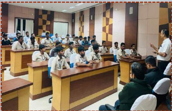
Industry Interaction (Pre-Placement session) for Post Graduate Diploma & Diploma students by officials from Shapers India Pvt. Ltd., Pune at Balasore centre on 13 th December, 2023.