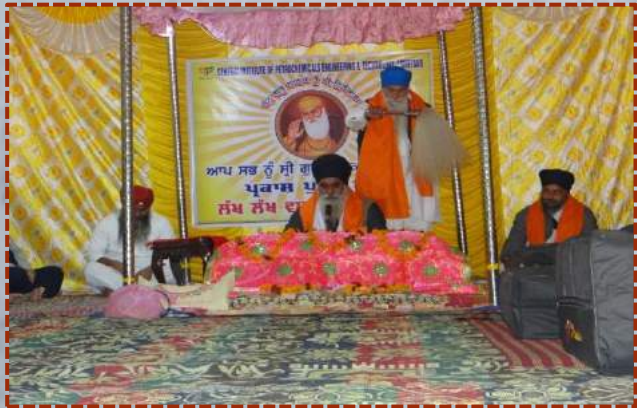
Celebration of Dhan Dhan Shri Guru Nanak Dev Ji Prakash Utsav at Amritsar centre on 4 th December, 2023.