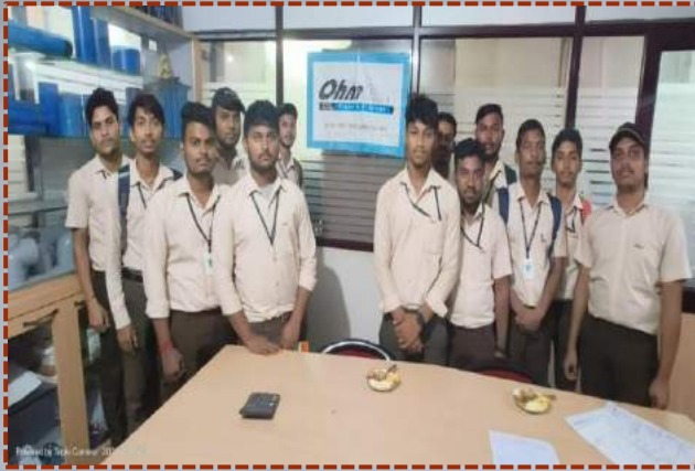
Students from Balasore centre visited M/s. Ohm Pipes Pvt. Ltd., Balasore on 6 th December, 2023.