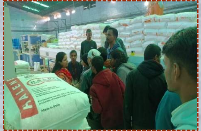
Students from Ranchi centre visited at M/s. Shiva Prints Pvt. Ltd., Ranchi, Jharkhand on 15 th December, 2023.