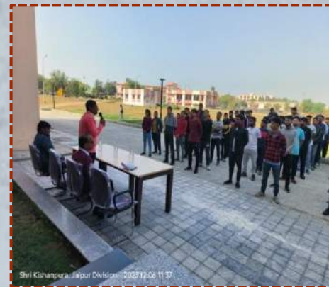
At Jaipur IPT centre from 6 th to 8 th December, 2023.