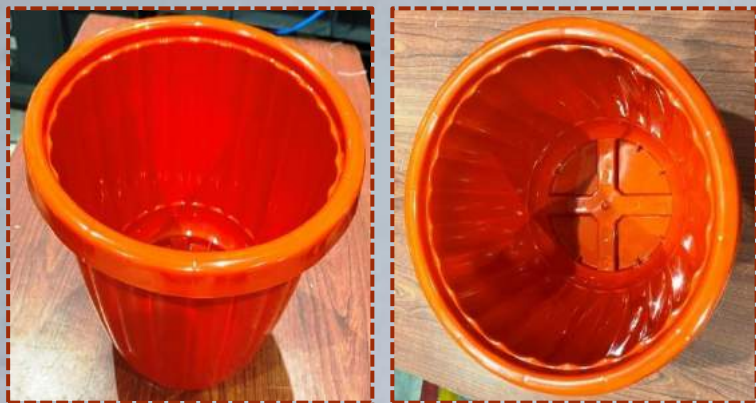
Product Name: 10 Inch Flower Pot Centre: Bhubaneswar CSTS