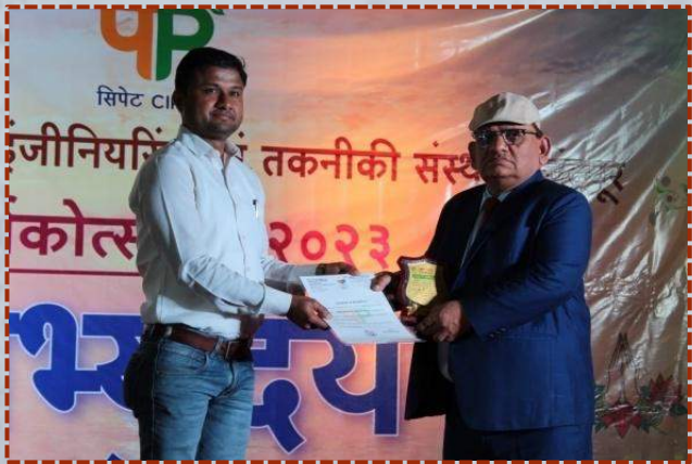
Felicitation to Entrepreneur