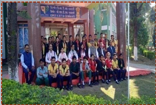
Students and Faculty members from Ideal Nursery High School, Kamrup, Assam visited Guwahati centre on 21 st December, 2023.