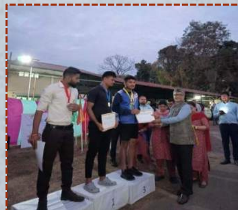
At Guwahati centre from 7 th to 8 th December, 2023.