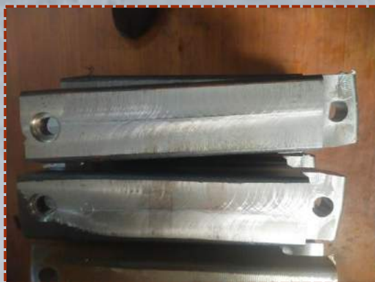
Product Name: Machining of various Dummy bar link Centre: Raipur