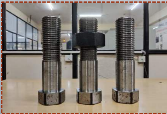
Product Name: : Machining of Hex head bolts Centre: Raipur