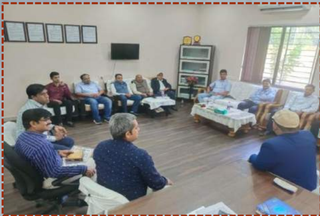
Industry Interaction Meet was organized at Chandrapur centre on 11 th December, 2023.