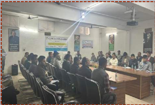
Industry Interaction Meet was conducted at Baddi centre on 22 nd December, 2023.