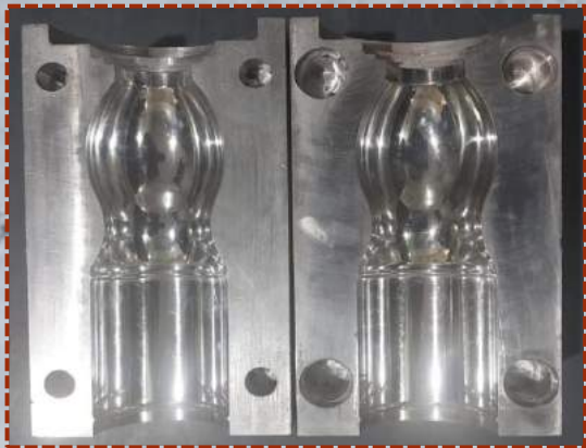
Product Name: 180 ml PET Water Bottle Centre: Bhubaneswar CSTS