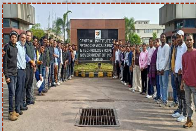
One day visit cum Awareness Programme on "Product design & Manufacturing in CAD/CAM/CNC" for the Students of Guru Ghasidas Vishwavidyalaya, Koni, Bilaspur, Chhattisgarh was provided at Raipur centre on 8 th December, 2023.