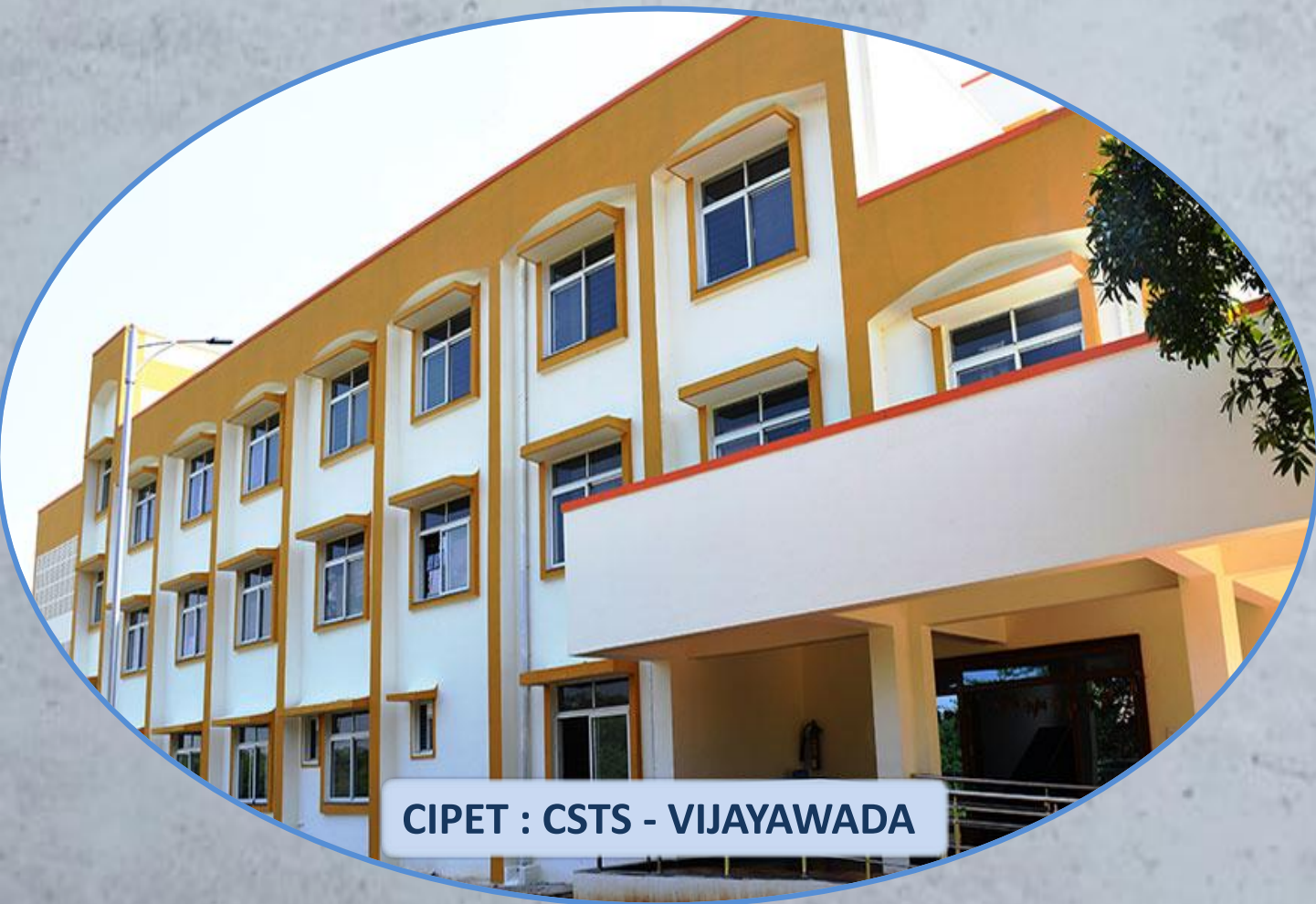
CIPET : CSTS - VIJAYAWADA