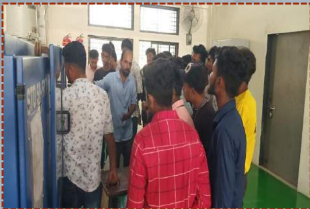
Students & Faculties from ITI Bilimora visited Navsari centre on 7 th December, 2023.