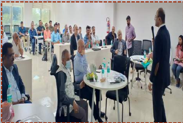
Industry Interaction Meet was organized at SARP- APDDRL, Bengaluru, on 27 th December, 2023.