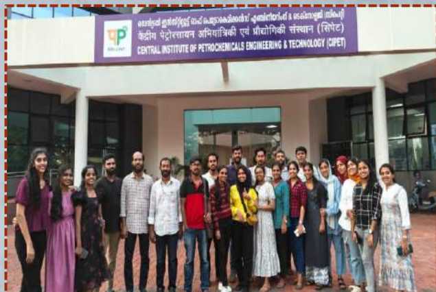
Students from NIT, Calicut visited Kochi centre for Industrial Exposure Training on 7 th December, 2023.