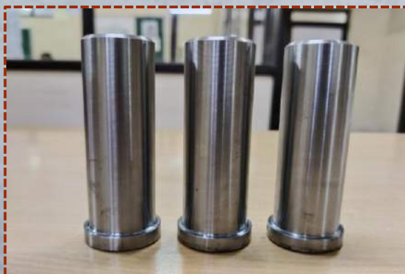
Product Name: Machining of various Pins in CNC Lathe Centre: Raipur