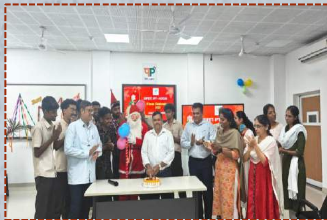
Christmas celebration by the students of Kochi centre on 22 nd December, 2023.