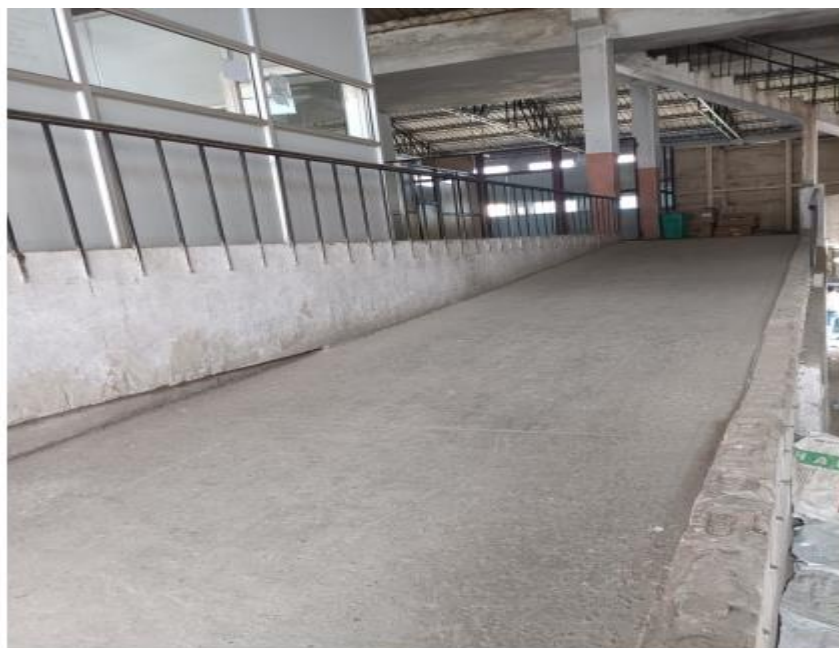
Barrier Free Built Environment